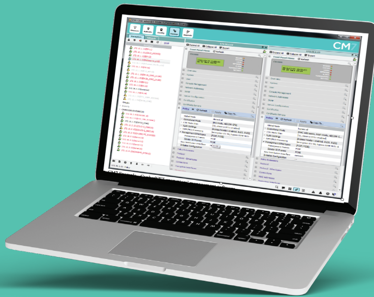
CM7 CypherNET encryptors' management software