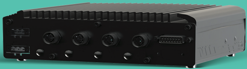
CN7000 example Milspec - Fanless, ruggedised IP67 form factor.